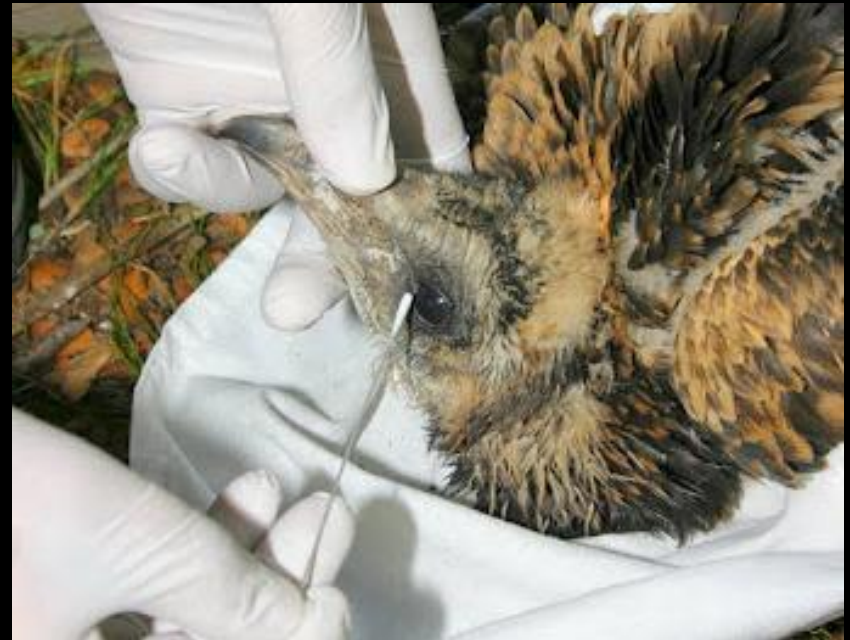
Toxicological and DNA analysis