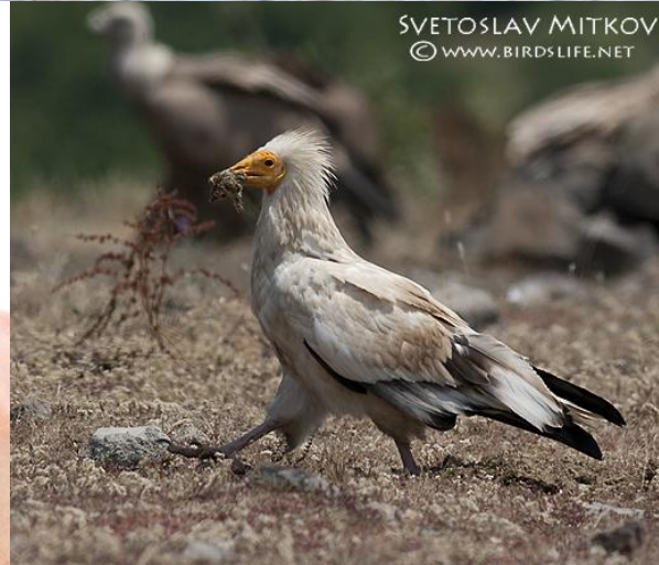
Indicator for environmental (and ours) 'health status'