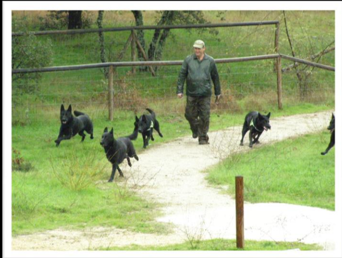
Network against poisoning