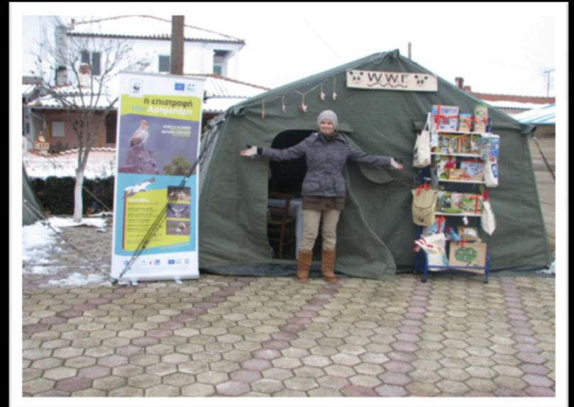
Rising public awareness