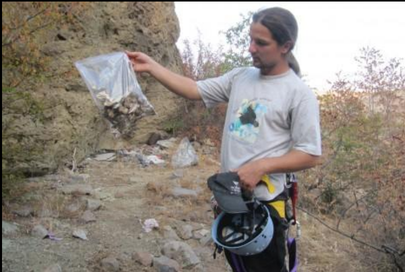
Study on the diet